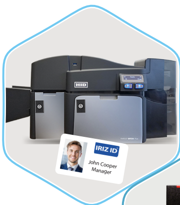
ID Card Printers